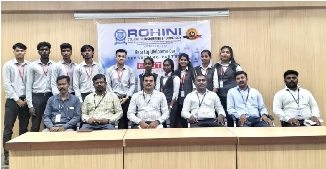
Placement Drive 18-09-2024- Besten Engineers & Consultants India Private Limited, Chennai